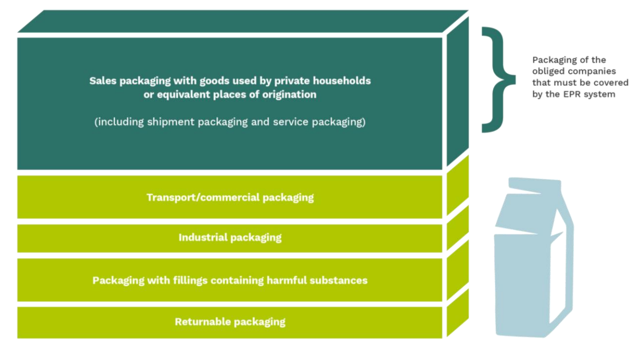
Figure 2: Example of packaging which must be included in the EPR system

The category of packaging known as service packaging represents a special case. Service packaging is defined as any packaging that is not filled with goods until the point at which it is passed to the consumer. Typical examples are bread roll bags, butcher's paper, potato chips boxes, takeaway coffee cups or bags for fruit and vegetables. Specifically in this case, the company marketing and selling the packaging materials – not the coffee – are required to participate in the EPR system and must pay the EPR fees. Companies using and distributing service packaging, such as bakeries or snack bars, in contrast, do not have to pay EPR fees for this service packaging material. However, these companies should obtain evidence from their upstream distributor (the seller of the packaging material) that he or she paid into the EPR system. Proofe could be ensured by an invoice, a delivery note or via a contractual agreement.<sup>1</sup>.