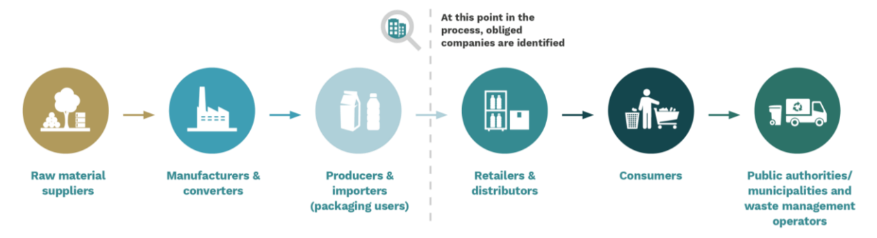
Figure 3: Simplified supply chain and the point at which obliged companies become liable for EPR fees

As a rule, the obliged producer or the obliged importer is the first company to distribute the goods in the country concerned, and is therefore obliged to pay EPR fees. One exception to this rule is service packaging (e.g. plastic bags, food containers), which is only used when the goods it carries are sold. For this type of packaging, the company selling the empty service packaging to retailers, street food outlets, and other places where the packaging will be filled is obliged to participate in the EPR system. Due to the high number of fast food and street food stalls, for instance, it would not be feasible to include them as obliged companies in an EPR system.