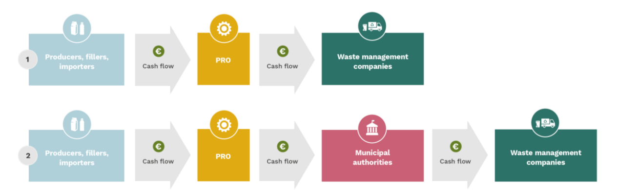
Figure 5: Models for financial flows from PROs to waste management companies

There are a number of other variations that incorporate elements from both models to reflect circumstances in specific countries. Examples include: