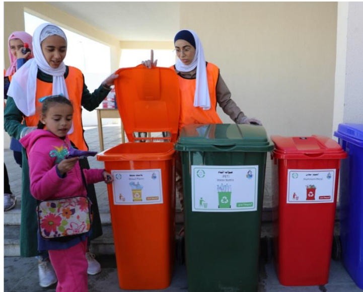
Photo 1: Waste separation in schools in Zarqa, Jordan

Sustainable waste management also depends on changing consumers' attitudes towards waste , and particularly on creating a sense of civic collective responsibility for it. Making sure people are informed about both the benefits of proper waste management and the adverse effects of failure to manage it effectively is key to promoting this change. Increasing awareness of the effect waste can have on health and the environment is also crucial in preventing mismanagement of waste. For a waste management system to thrive, every level of society, from local communities to schools and universities, businesses, different organisations and governments, has to buy into it, and work together to build a culture that will help it to become established.