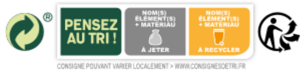
Figure 2: The French 'Triman' is printed on packaging to remind consumers to sort their waste

Another way of incentivising consumers to separate packaging waste is using deposit refund systems (DRS) . > See Factsheet 10 In a DRS, a set deposit is added to the purchase price of a packaged good (e.g. a drink in a PET bottle). Once the product has been consumed, the consumer can claim the deposit (or a voucher for the same amount) by returning the empty packaging. This payment acts as an incentive to bring the packaging back to take-back stations, instead of disposing of it as waste.