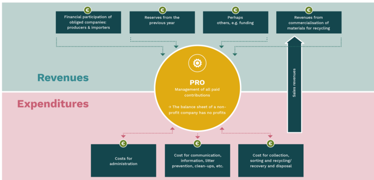
Figure 1: Revenue and expenditure (for a non-profit PRO)

However, both for-profit and non-profit PROs can use surpluses to generate accruals for future waste obligations, or reduce their prices so they can use up their reserves. Some countries put a cap on the size of the reserves a PRO can generate.