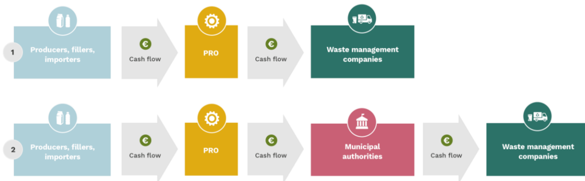
Figure 5: Models for financial flows from PROs to waste management companies

There are a number of other variations that incorporate elements from both models to reflect circumstances in specific countries. Examples include: