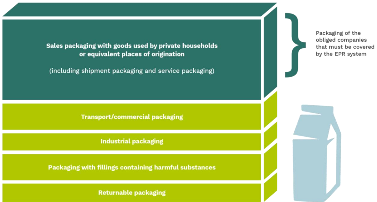
Figure 2: Example of packaging which must be included in the EPR system

The category of packaging known as service packaging represents a special case. Service packaging is defined as any packaging that is not filled with goods until the point at which it is passed to the consumer. Typical examples are bread roll bags, butcher's paper, potato chips boxes, takeaway coffee cups or bags for fruit and vegetables. Specifically in this case, the company marketing and selling the packaging materials – not the coffee – are required to participate in the EPR system and must pay the EPR fees. Companies using and distributing service packaging, such as bakeries or snack bars, in contrast, do not have to pay EPR fees for this service packaging material. However, these companies should obtain evidence from their upstream distributor (the seller of the packaging material) that he or she paid into the EPR system. Proof could be ensured by an invoice, a delivery note or via a contractual agreement. 1